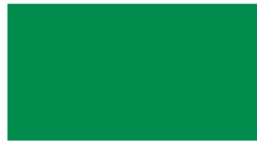
219 Verde Band