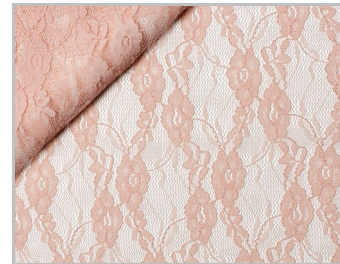
104 rosa pink