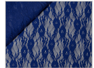
109 bluette turquoise