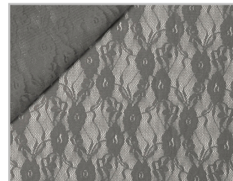
102 grigio grey