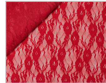
110 rosso red