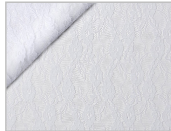
99 bianco white