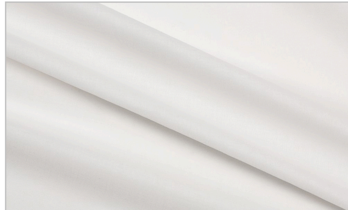
50 bianco white