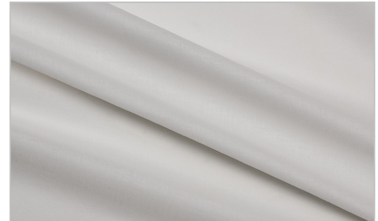
101 panna cream