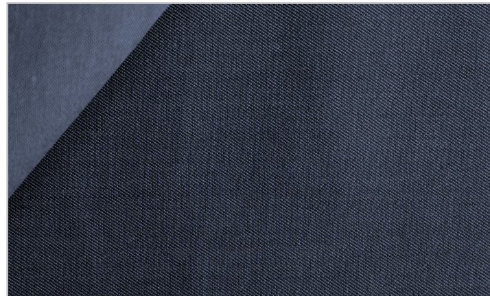
23 blu scuro dark blue